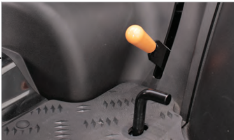
Differential lock is standard with foot pedal engagement for SA223, SA325, and SA425.