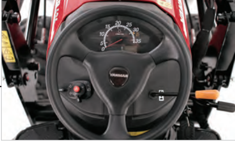
Simple to operate; easy access to every control.