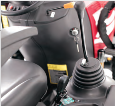
Work comfortably with armrest-mounted loader control lever, while True Position Control lever (below joystick) delivers precise operating height of rear implements.