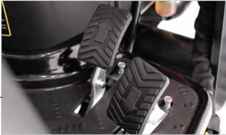
Switch seamlessly between forward and reverse with two side-by-side hydrostatic transmission pedals.