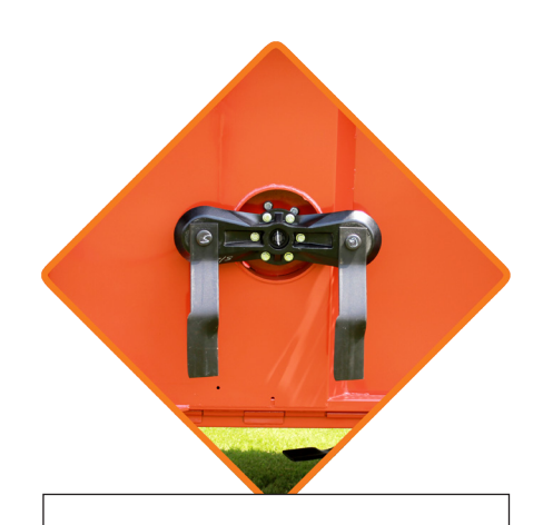
Heavy-Duty Blades & Infinity Carrier