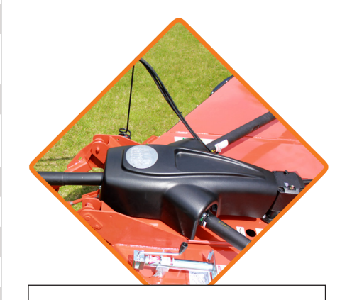
New Composite Divider Shield