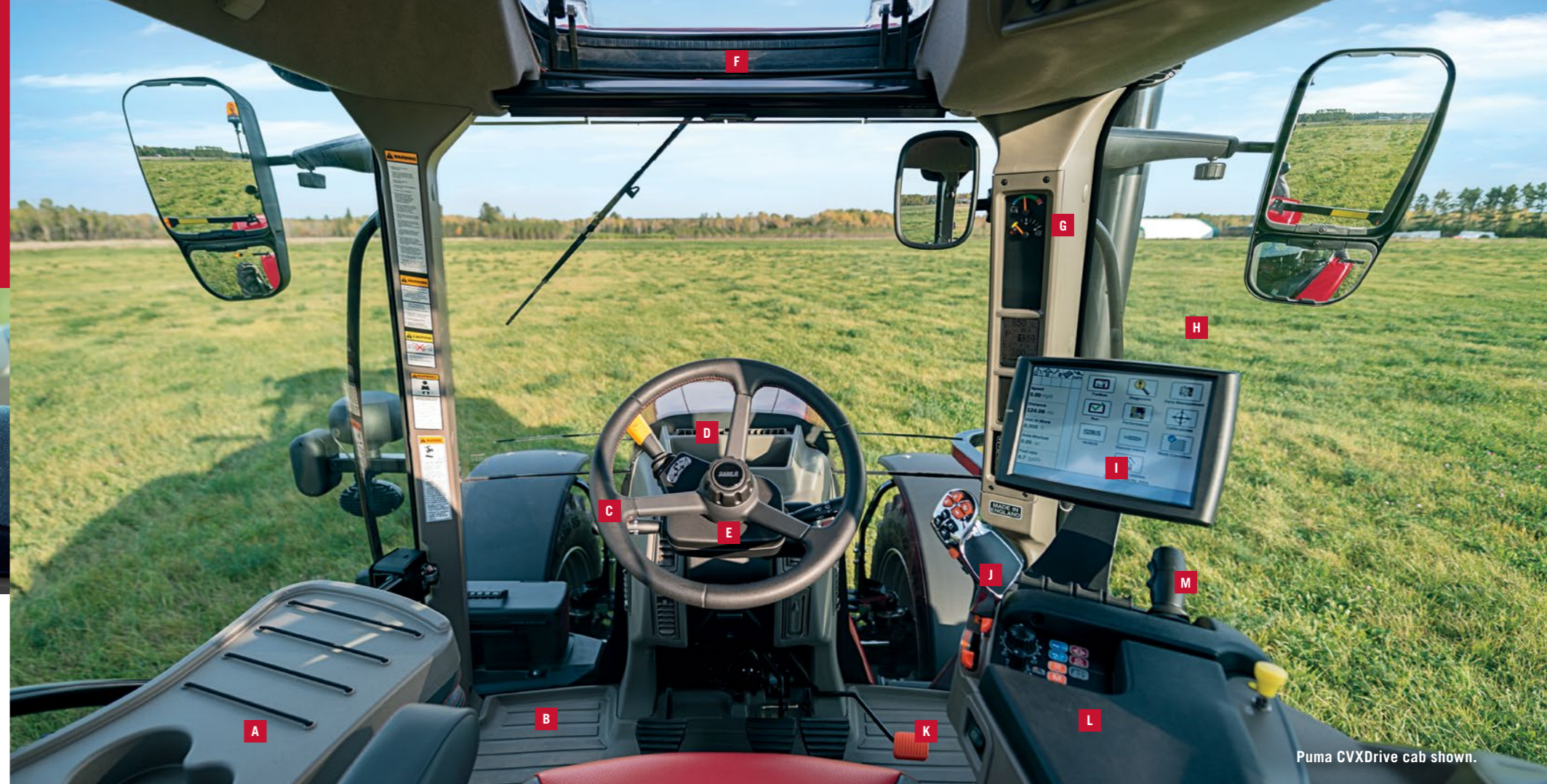
Puma CVXDrive cab shown.